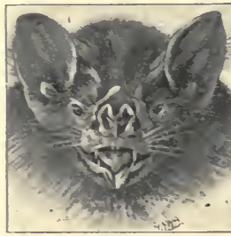
FIG. LXXV. DESMODON ROTUNDUM. RUFOUS VAMPIRE BAT.